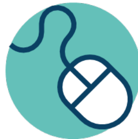
Copy & Paste