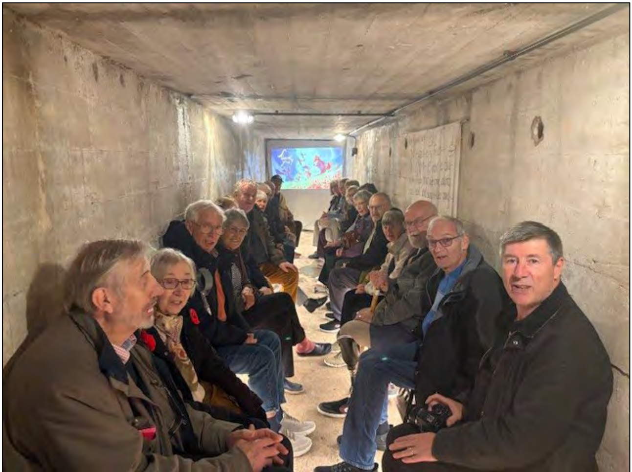
The others are behind the cameraman!