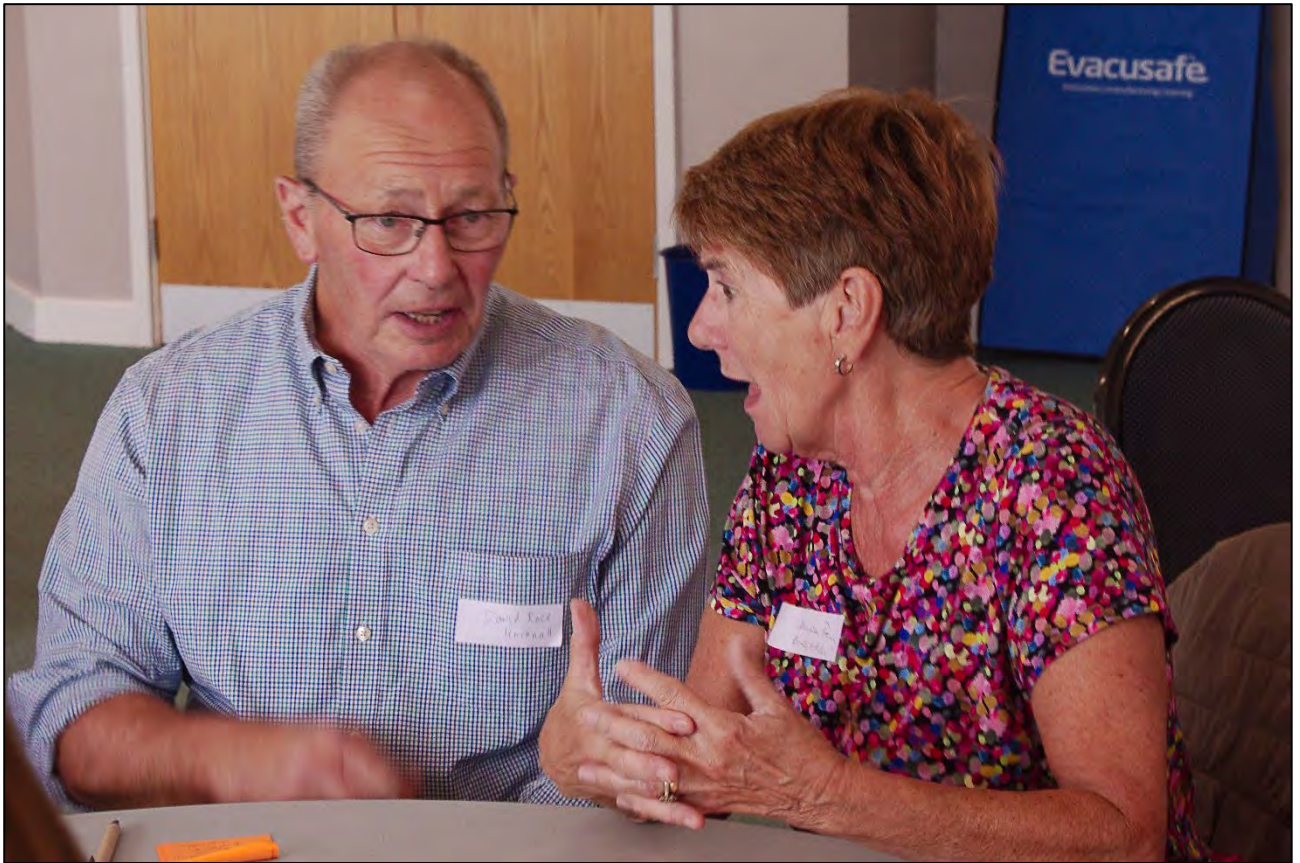
Enthusiasm for interest groups