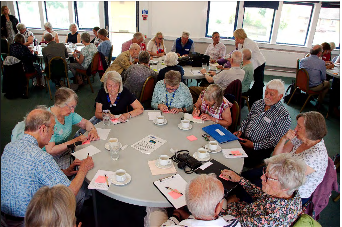
“What essential tasks do Group Leaders/Convenors need to ensure are done?”