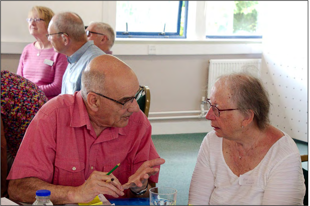
Every great idea starts with a scribble