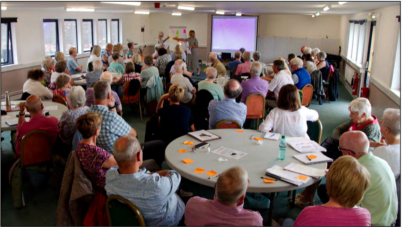
Member's ideas come together