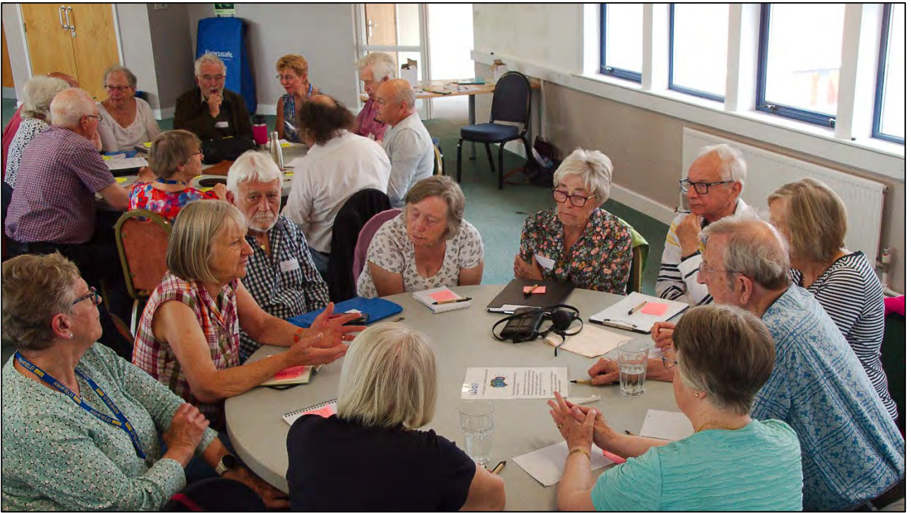
Laughter, learning, and lots of list-making