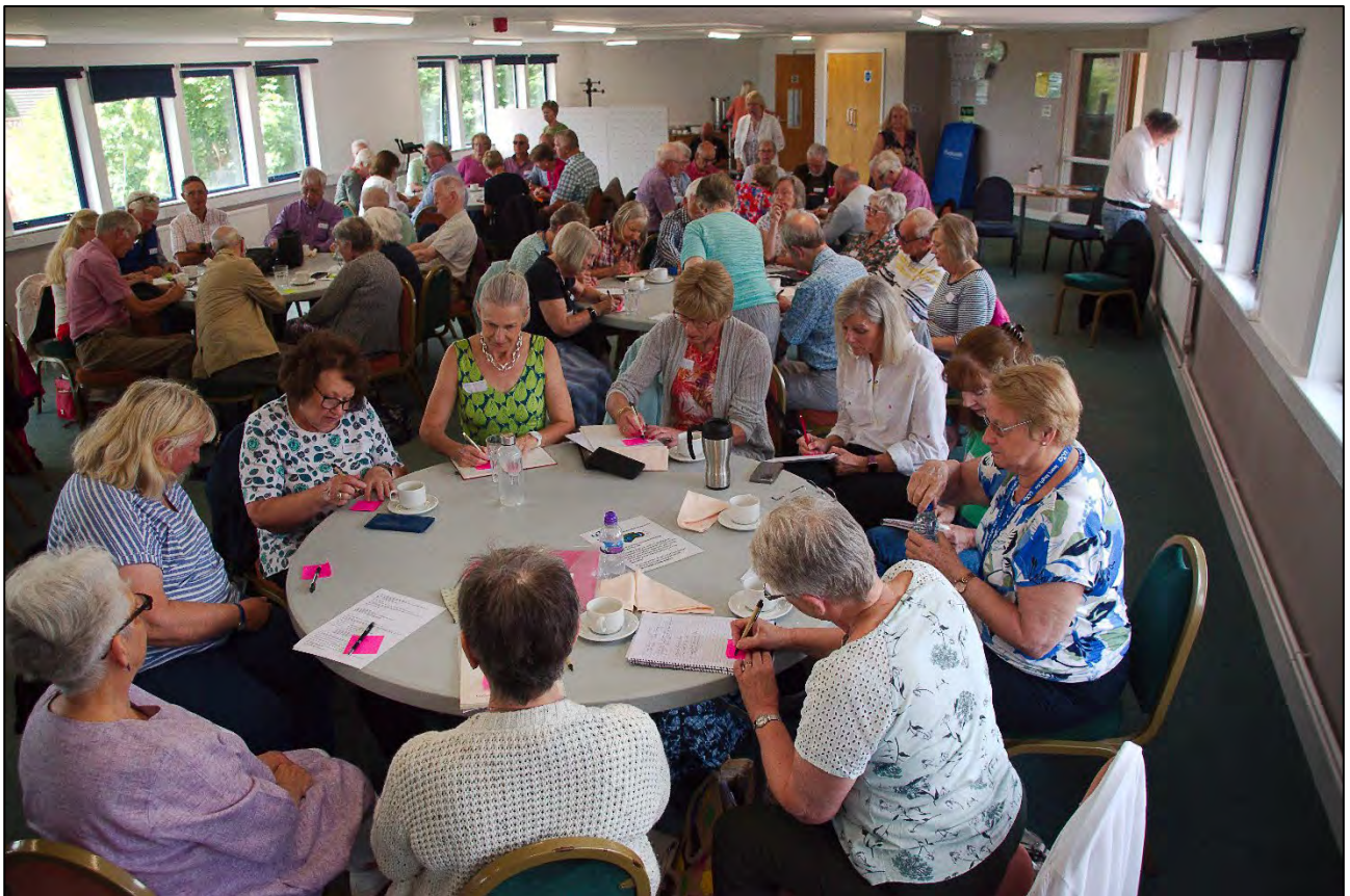
Members get stuck into the first activity