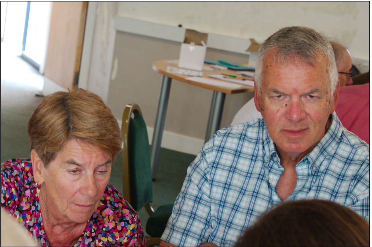
Learning from each other to make interest groups even better