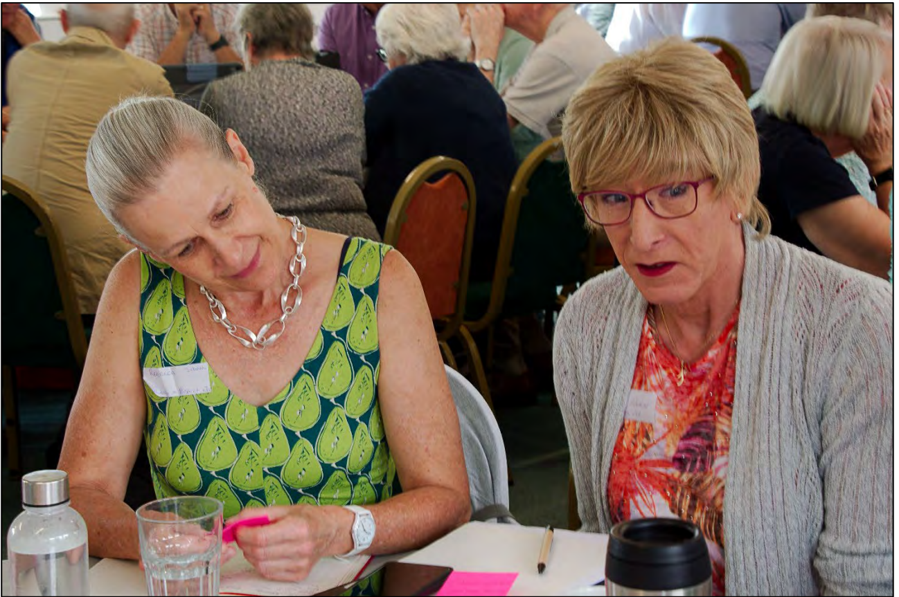
Peer learning in action – members inspiring one another