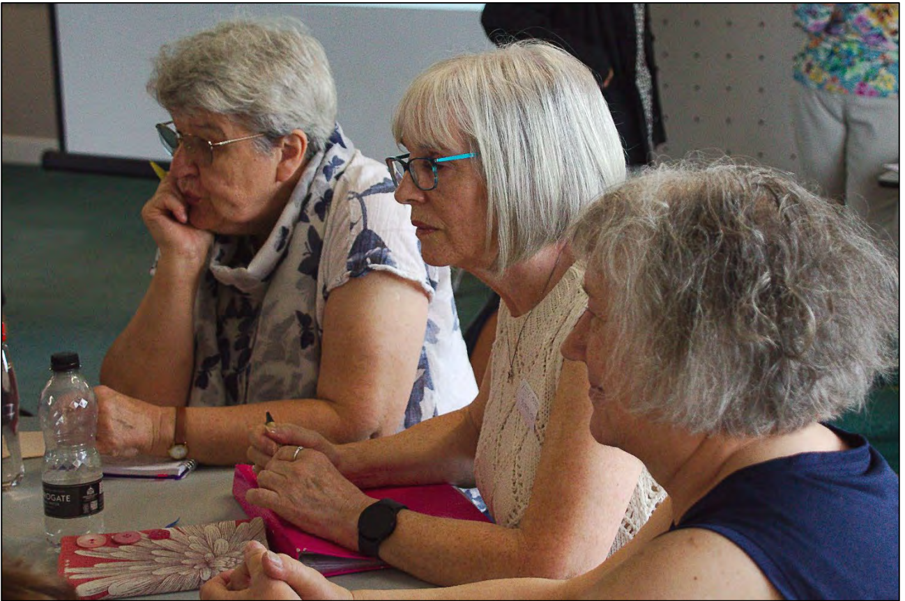
Listening to big ideas