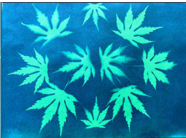
Naylor Ltd Cyanotype 2