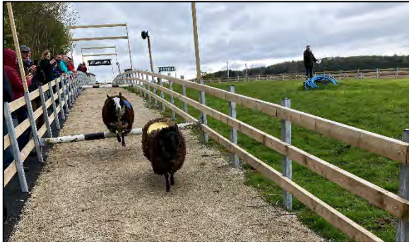
Sheep racing at Cannon Hall