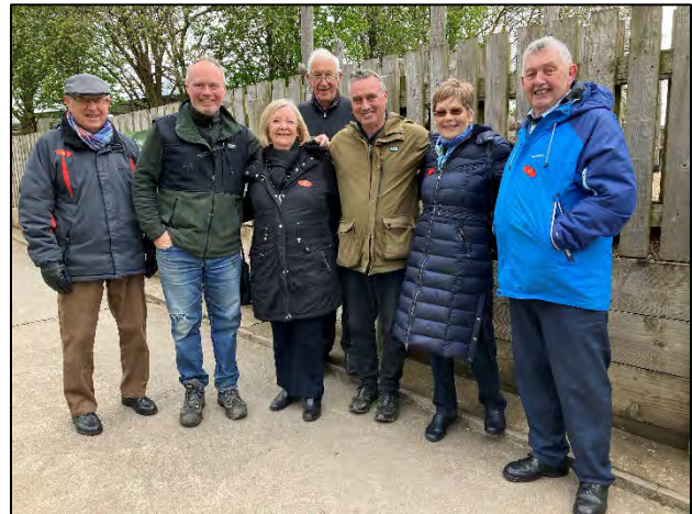
Our members with the brothers who run the sheep racing