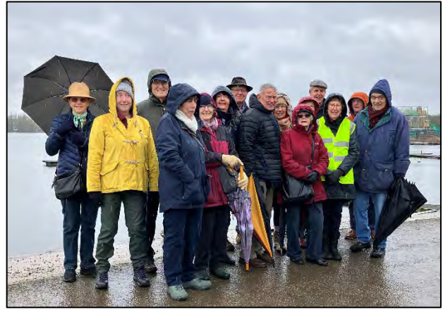
Strollers at Kings Mill reservoir