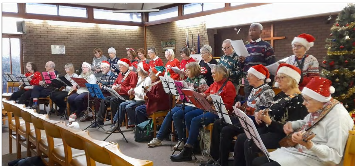
Stapleford's combined ukulele players and choir launch the Christmas fuddle