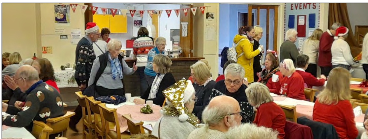
As the last few queue at the buffet, drinks have been served, plans for Christmas dominate the conversations.

Tables, decorated by the Committee and volunteers, captured the festive spirit as an amazing selection of delicious food, generously contributed by the members (with a special section for the gluten-intolerant) served all tastes.